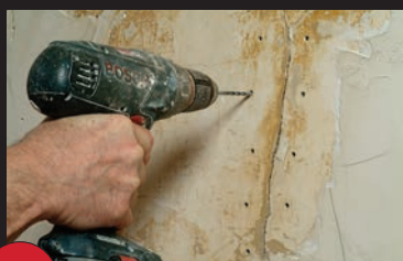
1 DRILL IT