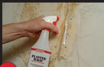
2 SPRAY IT