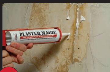
3 GLUE IT